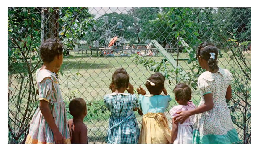
Gordon Parks, Outside Looking In, Mobile, Alabama, 1956