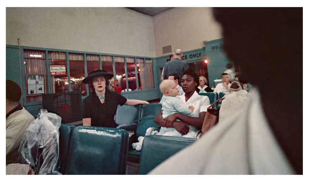
Gordon Parks, Airline Terminal, Atlanta, Georgia, 1956

After reading, have students focus their attention on six images from this discovered archive using the critical media literacy questions in Handout 2.