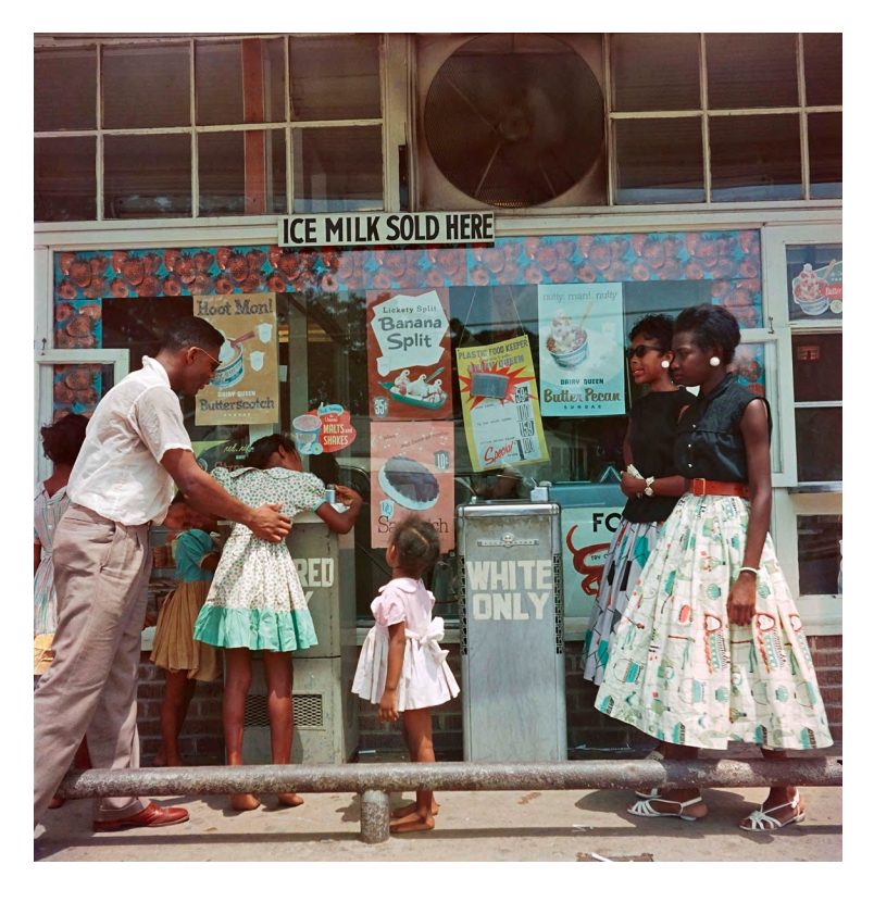
Gordon Parks, At Segregated Drinking Fountain, Mobile, Alabama, 1956