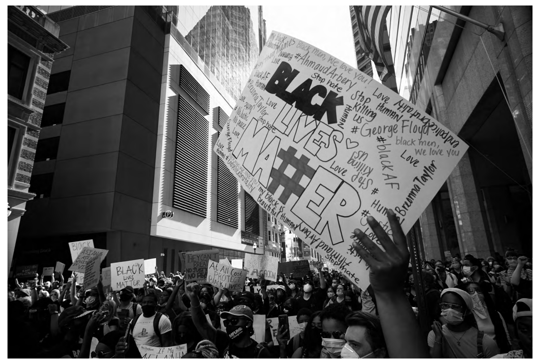
Devin Allen, BLM names of those killed, 2020