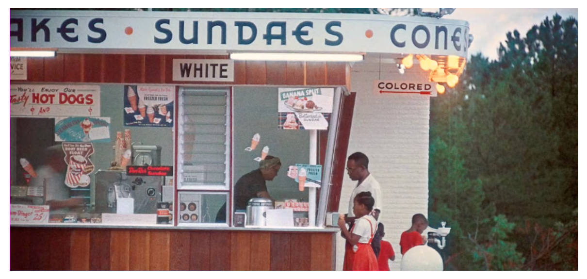
Gordon Parks, Untitled, Shady Grove, Alabama, 1956