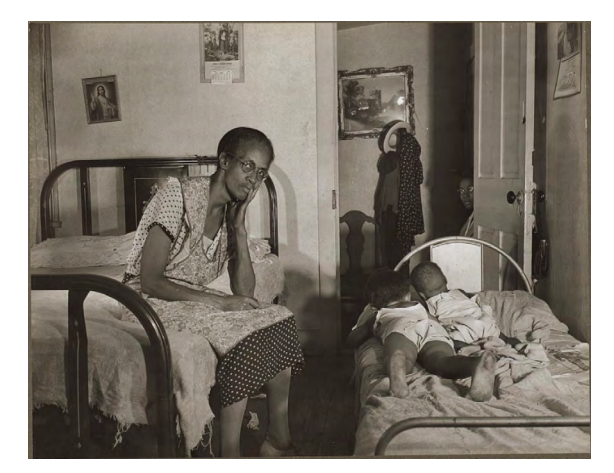
Gordon Parks, Untitled, Washington, D.C. 1942