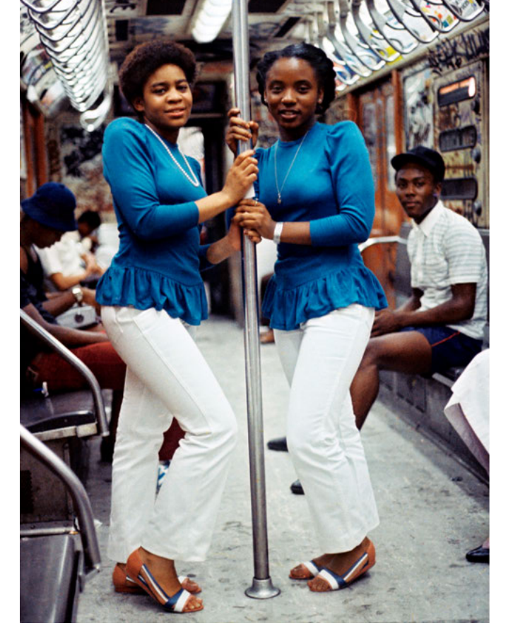
Jamel Shabazz, Soros for Life, Soros for Life , Crown Heights, Brooklyn, NYC, 1981